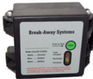
Electronic brake safety breakaway system