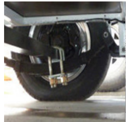
Suspension & Brakes