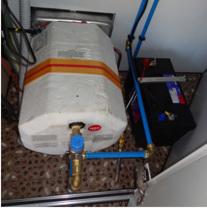
Hot Water Unit