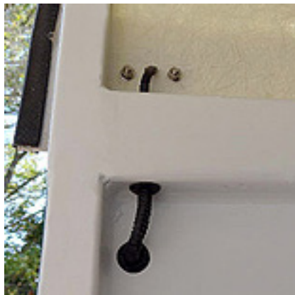
All wires that run through chassis are grommited